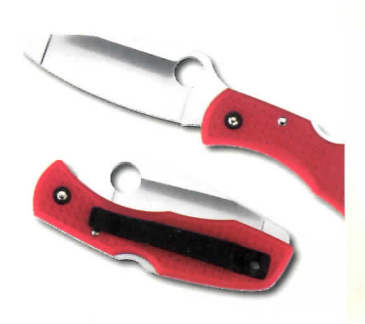
Red-handled trainer versions of Spyderco's Endura and Delica

pyderco is going to begin making "trainers" sometimes called "drones". A trainer is a replica of an existing knife that is produced without an edge or point. Sometimes trainers are made out of wood or plastic, although in our opinion the best trainer is one that simulates an actual model in size, weight and function but has been ground so that the point and edges are safe to handle. It is very difficult to turn an actual knife into a trainer because dulling the edge is a lot different than never having created an edge. Keeping the edge at full thickness with a rounded tip at full thickness is far safer than simply trying to grind one down.